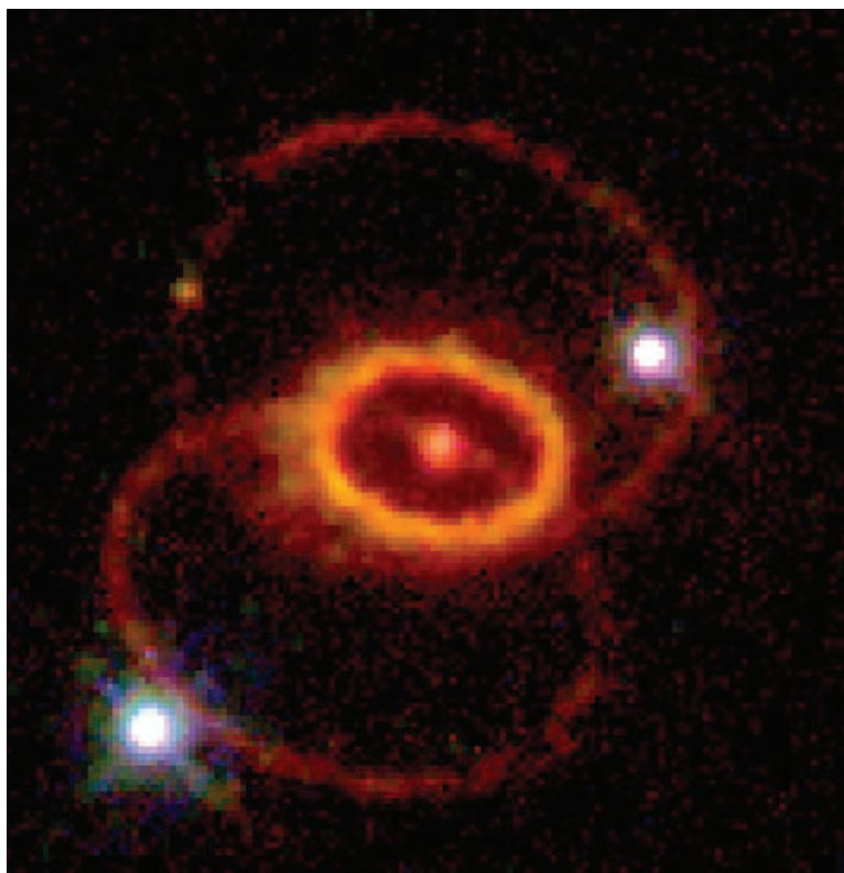
Fig. 1. The three-ring structure in the circumstellar space of the SN 1987A observed by the HST. The ER is on the equatorial plane, and the two ORs are near 45° latitudes. The original picture is rotated 90° for easy comparison with Fig. 2.

An important advantage of our simulation is that it adopts a highly accurate scheme for the MHD computation. We use the finite-volume total variation diminishing scheme with a third-order numerical flux based on the monotonic upstream scheme for the conservation law approach (5). Our assumptions are implemented in the MHD simulation by specifying the inner boundary conditions. Here, we set the spherical inner and outer boundaries at r = 0.1 and 1.5 ly. The primary boundary conditions for the RSG wind are given as density \rho = 3000 \times m_p \text{ g/cm}^3 (where m_p is proton mass), temperature T = 5 \times 10^3 \text{ K} , radial velocity V_r = 10 \text{ km/s} , and toroidal magnetic field B_\phi = B_0 \cos \theta with B_0 = 37 \text{ nT} (where \theta indicates the latitude). In addition, the polarity change is given for B_\phi across the equatorial plane with a neutral sheet width of 3.0°. Inside the neutral sheet, density is increased to balance with the magnetic pressure. Assuming a coronal hole at latitudes higher than 55.7°, the primary boundary conditions are modified there to give high-speed hot plasma, increasing V_r by a factor of 4.0 and increasing T by a factor of