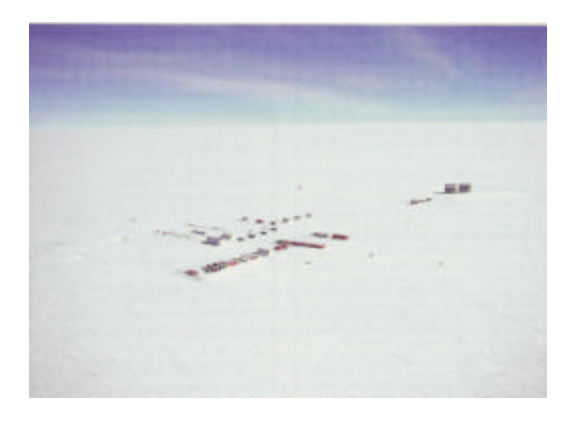
Fig. 1 An overview of the Dome C summer camp.

The summer camp at Dome C (Figure 1) is a collection of buildings housing up to 50 (people for 10-12 weeks each summer. It forms a surprisingly cozy "international village", supplied by Twin Otter aircraft originating from the Italian Terra Nova Bay coastal station, and by tractor trains that make three