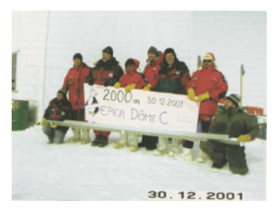
Fig. 2. The EPICA Dome C drilling team shows off the core from the 2000-m depth.

shelter is maintained at a temperature of -20°C: this is an excellent temperature for maintaining the cores, but a challenging environment for the scientists! Once the core has been physically measured and marked, its electrical properties are measured in the dielectric profiler (DEP). It then passes through a series of bandsaws that dissect the cross-section into pieces for different measurements and 1aboratories. A qualification in cold-temperature carpentry would be an excellent preparation for a season in the EPICA science shelter!